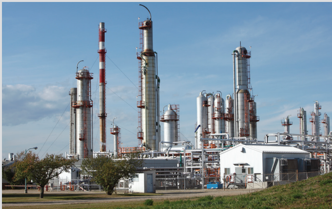
Chemical and Petrochemical Plants and Refineries

Typical hazardous and industrial environments where protecting equipment against poor power quality and disturbances is essential to ensure clean, uninterrupted power for your facility.