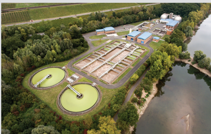
Water and Wastewater Treatment Plants